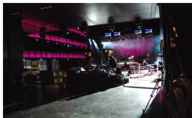
2015: Norwegian Grammy (Spellemannsprisen)