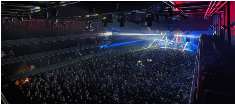
2015: Simple Minds

* Prolyte H40V truss operated by 12 x SWL1T point hoist